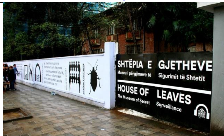
House of Leaves