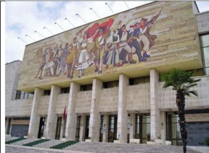
The National Historical Museum , Tirana

Of particular interest to the theme of our COST Action are the two Bunk'Art Museums operating since 2015 in Enver Hoxha's nuclear bunkers. Bunk'Art 1 , at the foot of Mount Dajti, is bigger and more impressive than Bunk'Art 2 , which is located in the city centre. Of equal interest is the museum in the premises of the former quarters of the secret police, dubbed " House of Leaves ." See the agenda above for the schedule of guided tours.