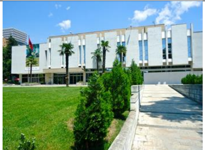
The Art Gallery , Tirana