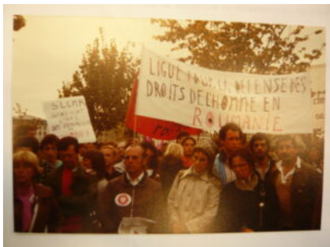
A protest by the Romanian League of Human Rights in Paris, from this organization archival fond kept at La contemporaine in 1970s.